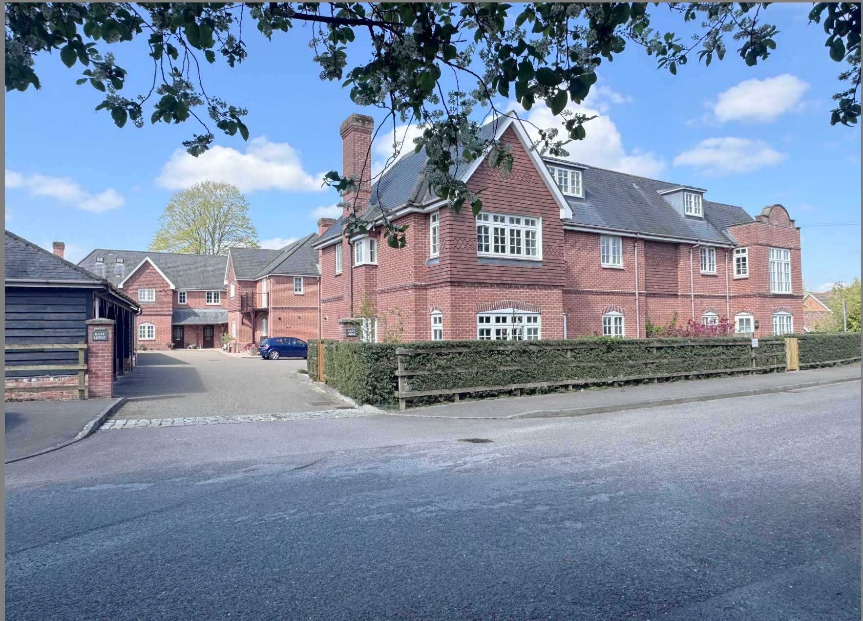
Gate Lodge, Enborne Gate, Newbury, RG14 6GL